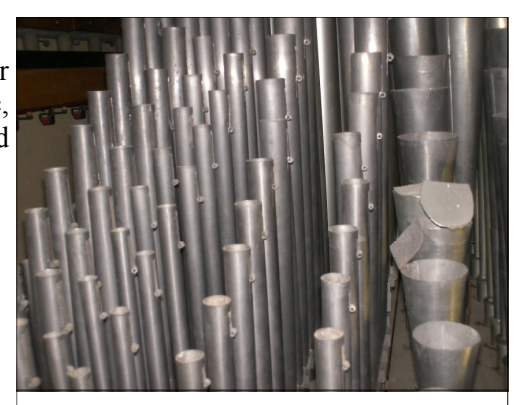
The Trumpet pipes on the right and the Principale pipes on the left

The voicing of the pipes is ideal for Romantic and Contemporary music, but Baroque music can also be played with success.