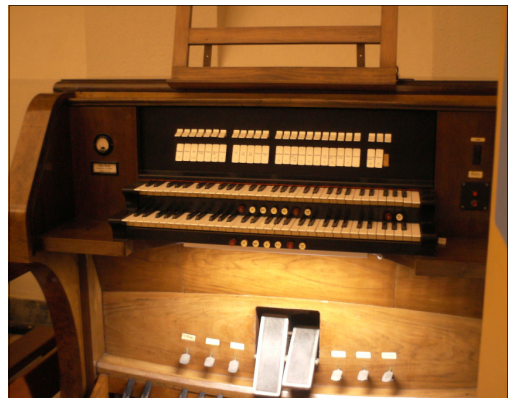
The organ console

The organ of St. Francis Catholic Church in Rhodes was built in 1939 by the well known organ manufacturer, Pinchi but its construction was not completed until after the start of the Second World War, according to the builder's son, Guido Pinchi. This organ is still the biggest church organ in Greece. It has two manual keyboards and a pedal-board. The console is in the nave of the church and is connected to the pipes by a strong thick cable. This kind of connection is called "electrical action".