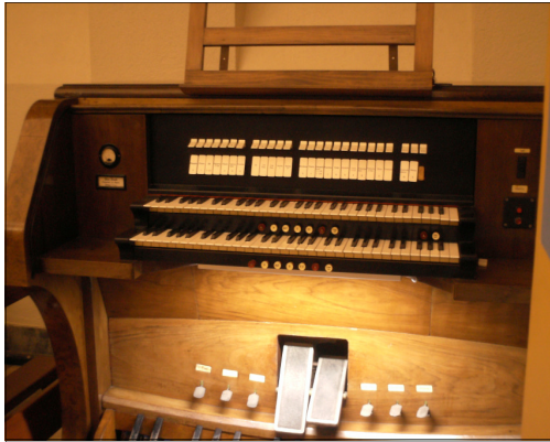
The organ console

The organ of St. Francis Catholic Church in Rhodes was built in 1939 by the well known organ manufacturer, Pinchi but its construction was not completed until after the start of the Second World War, according to the builder's son, Guido Pinchi. This organ is still the biggest church organ in Greece. It has two manual keyboards and a pedal-board. The console is in the nave of the church and is connected to the pipes by a strong thick cable. This kind of connection is called "electrical action".