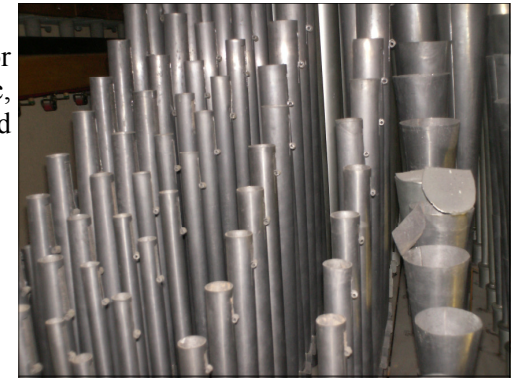
The Trumpet pipes on the right and the Principale pipes on the left

The voicing of the pipes is ideal for Romantic and Contemporary music, but Baroque music can also be played with success.